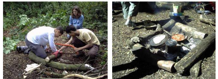
Left: students learning some woodland management skills Right: a gourmet feast cooking over the fire!

...Back at school, students were faced with learning how to look after themselves with staff at the nearby Paupers Wood project. The boys learnt woodland management skills, footpath laying, shelter building and fire making and even made their own lunch over the fire!